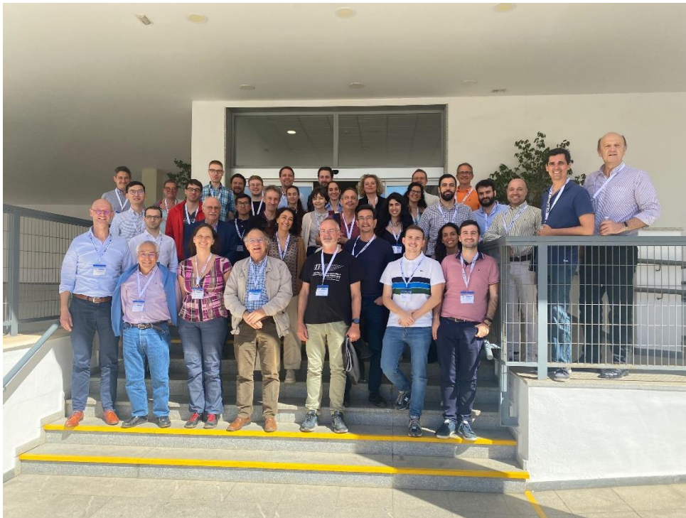
Group photo second day