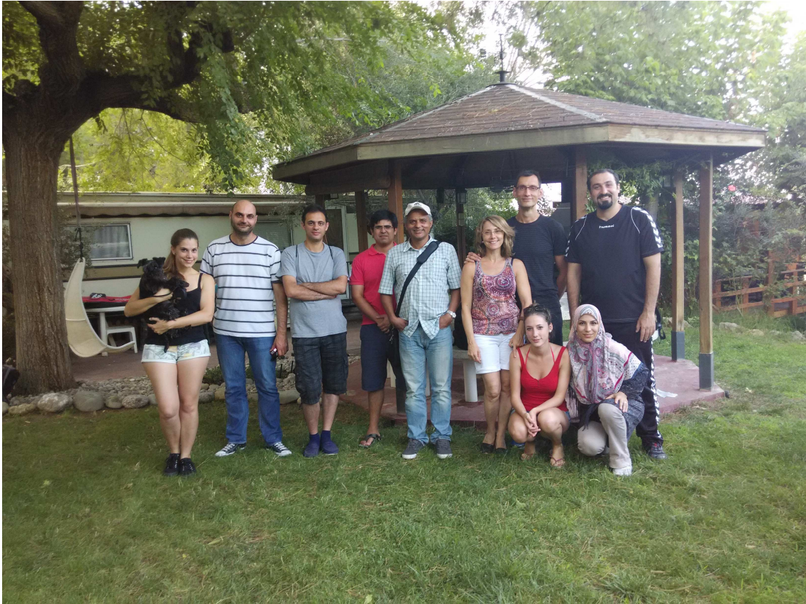
In the barbecue, the last day