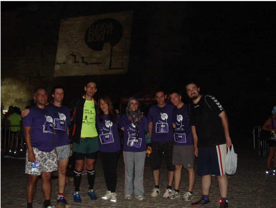
After the running competition