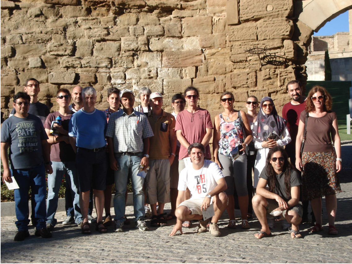
Participants visiting the Seu Vella