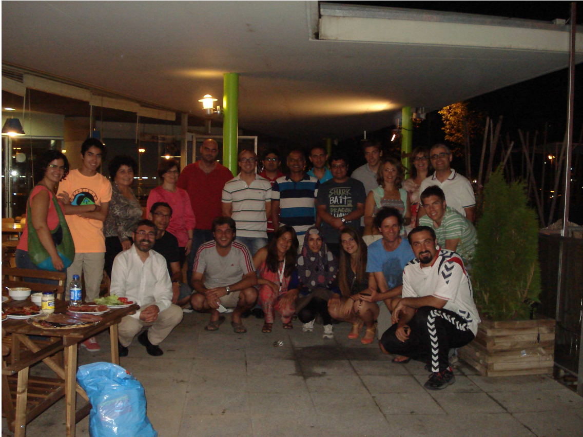
In the party with the typical dinner