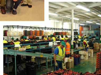
Abstract of main social activities