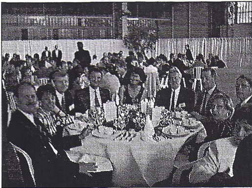
The "top-table" at the conference dinner

able to see on the web site all relevant information including names and addresses of participants, abstracts of submitted papers, the conference programme; they could also register and book hotels. Daily, at the lunch time, each participant received the Conference Bulletin published by the Organizing Committee.