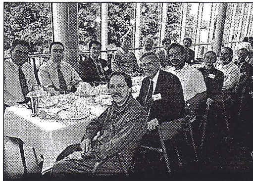
The lunch of the EWG coordinators with Raymond Bisdorff, vice-president of EURO

190 sessions covering a wide range of O.R. fields were scheduled in 33 streams: 8 devoted to mathematical programming and combinatorial optimization; 5 to production and scheduling; 5 to O.R. applications; 3 to MCDA; ... Overhalf of these sessions were invited contributions. The EURO working groups (EWG) were particularly active organizing 28 sessions.