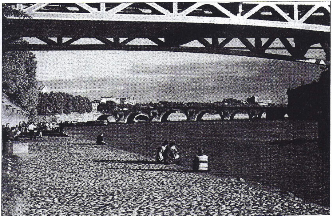
... In a beautiful town