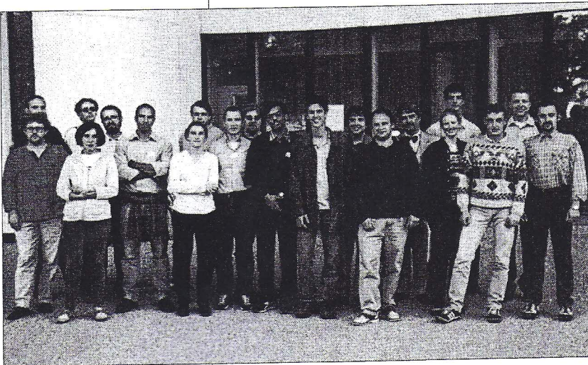
The ESI participants